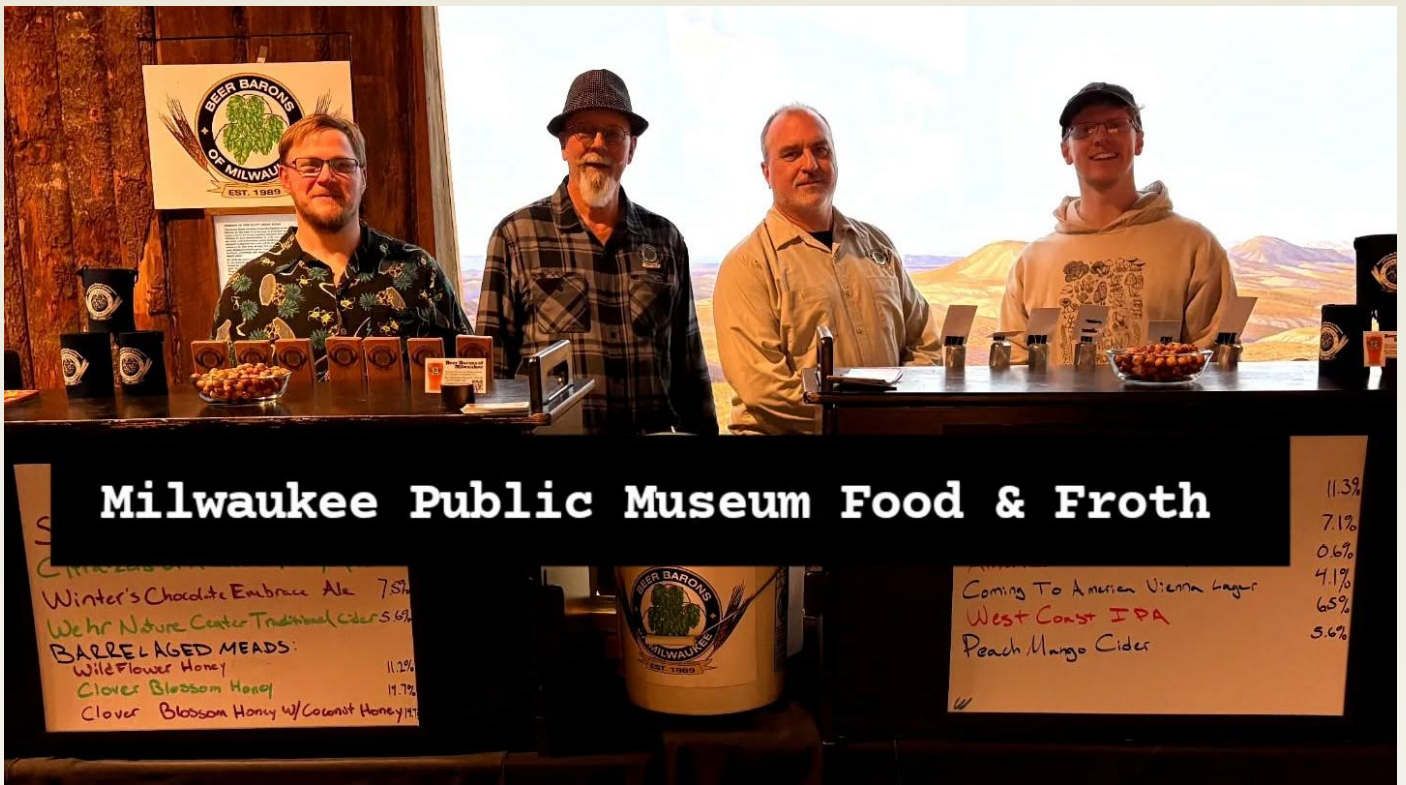
Food and Froth 2026