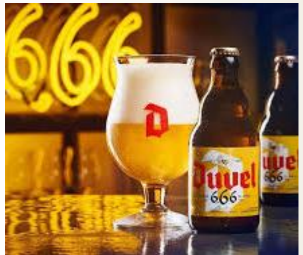
April Meeting Featuring Duvel Clones

"In heaven there is no beer. That's why we drink ours here"