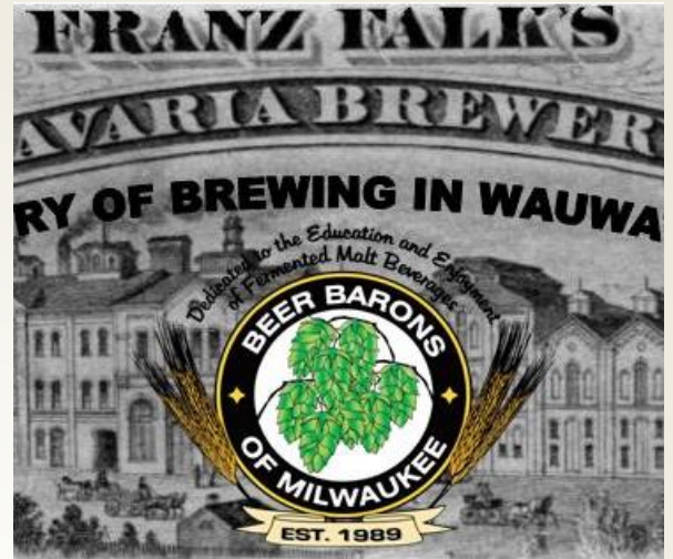
March Meeting Featuring History of Brewing in Wawautosa