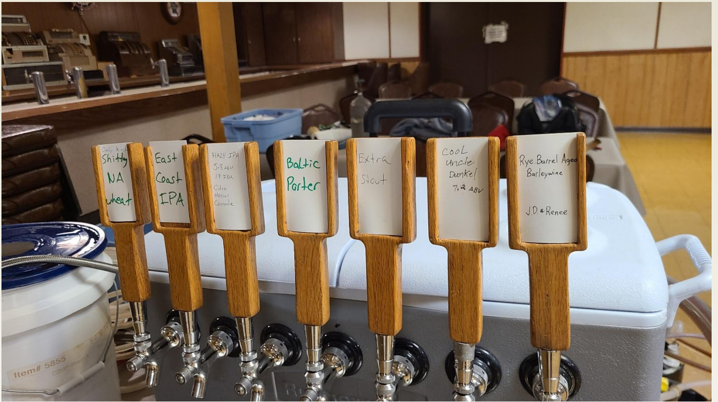
February's Home Brews