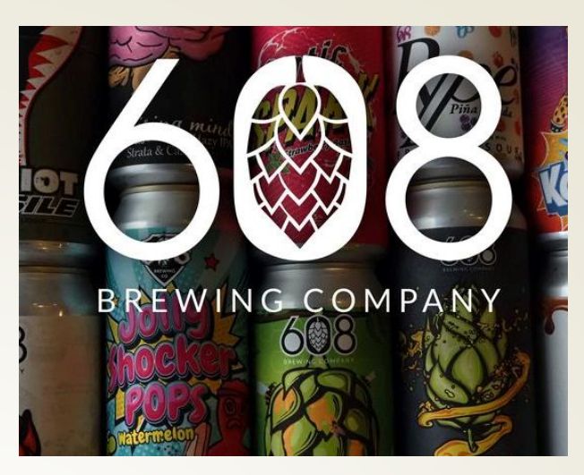
April Meeting Featuring 608 Brewing Company