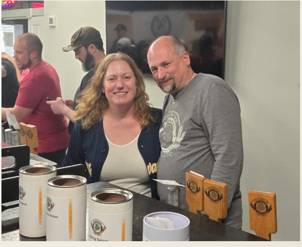
Kenosha Beer and Cheese Festival