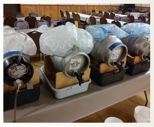
March Meeting Featuring Cask Ales