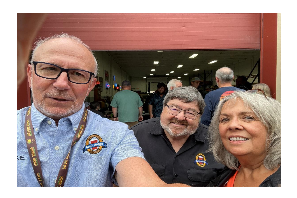
THE MICHIGAN MEAD CUP