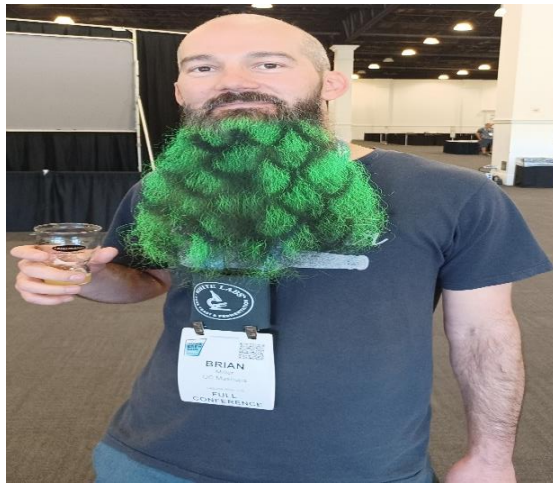
Another Home Brewer at the Convention