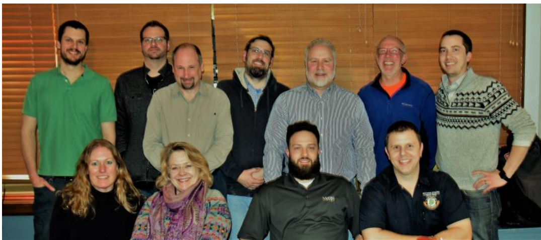
2018 and 2019 Board Members