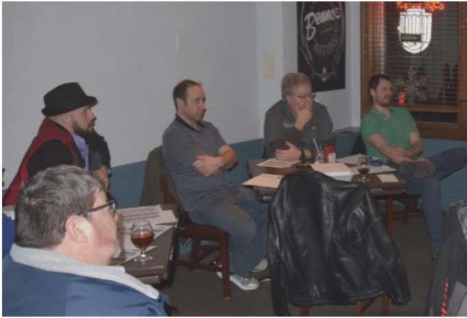
The outgoing and incoming board members and several other esteemed members of the Beer Barons met at Benno's for the January officer's meeting