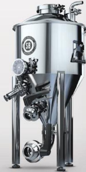
CF5 SPIKE CONICAL