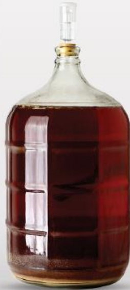
5 GALLON CARBOY

Beware of shattered glass! And is that a scratch?